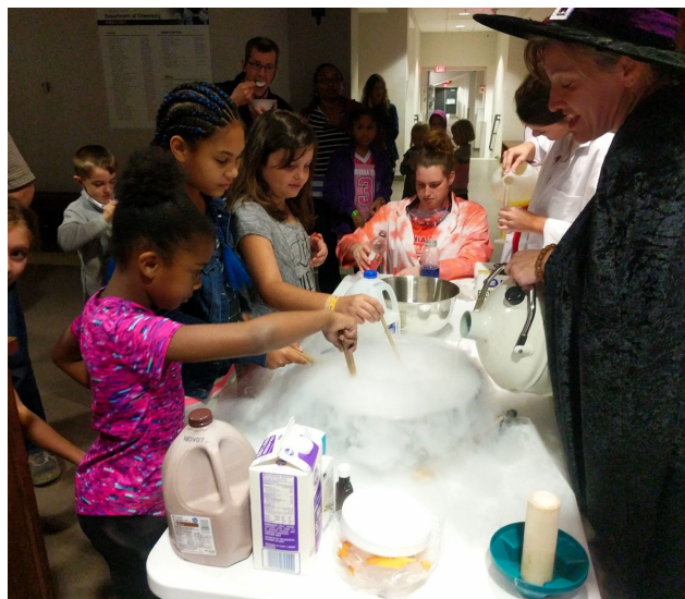
Local kids enjoying Liquid Nitrogen Ice Cream

To celebrate National Chemistry Week, we will enjoy a show of resounding booms and colorful flames. The ACS student affiliates and the Chemistry Department at Virginia Tech invite the local community to enjoy a demonstration of chemistry that we call “Chemical Illusions.” In this activity, children of all ages can enjoy spectacular demonstrations of important principles of chemistry including acids-and-bases, oxidations-and-reductions, the behavior of gases, and the properties of interesting materials from liquid molecular nitrogen to burning thermite. The demonstration pictured below is known as the “Vomiting Pumpkin.”