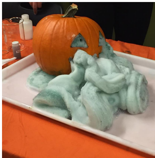
The Vomiting Pumpkin